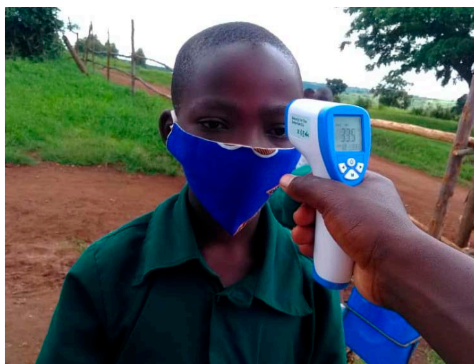
SOPs taken at Butimba for candidates