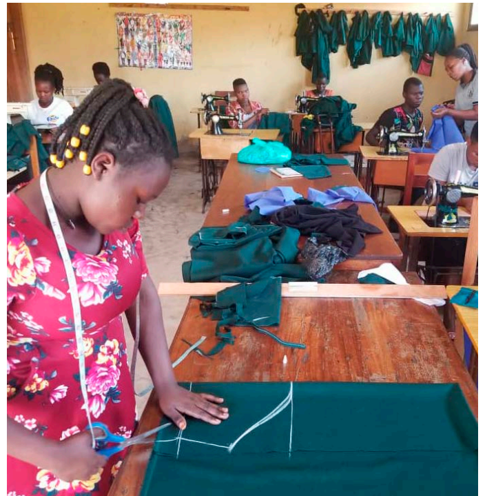
Practical skills are essential for the future of the students