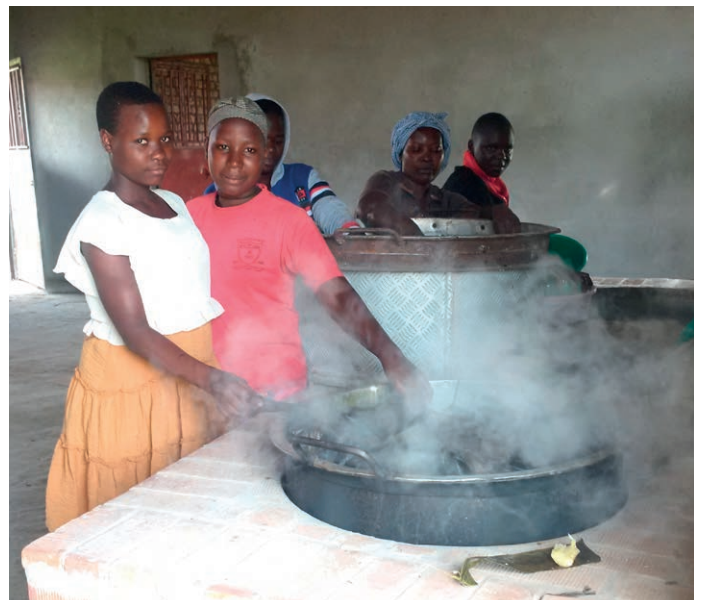
The big kitchen at Nakaziba