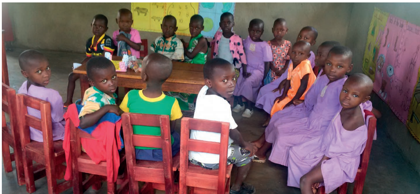
Middle class in Kamusenene nursery school