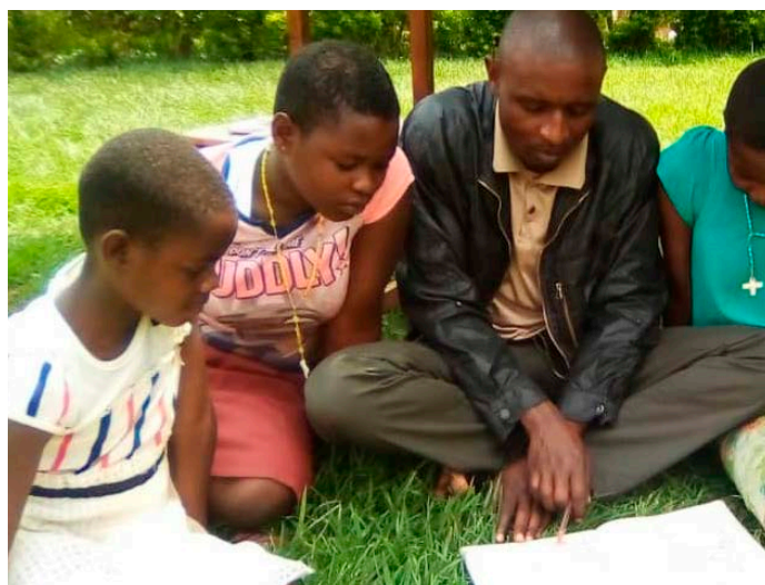
Homeschooling by a teacher from Kakindu