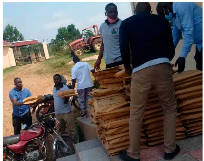
Porridge Program, distribution of learning packages