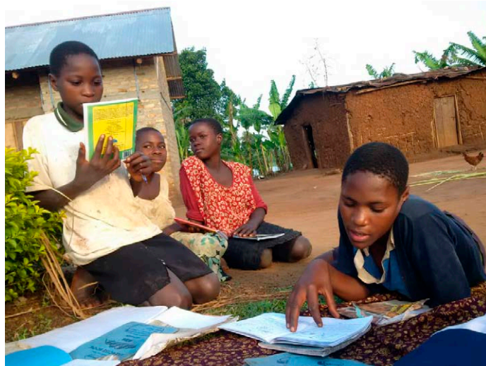
Children studying from home during lockdown