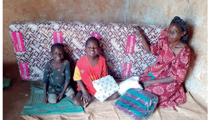
Beddings for children with special needs

Both our nurses in Busunju and Mubende division started visiting children who were sick in the field and offered them treatment services.