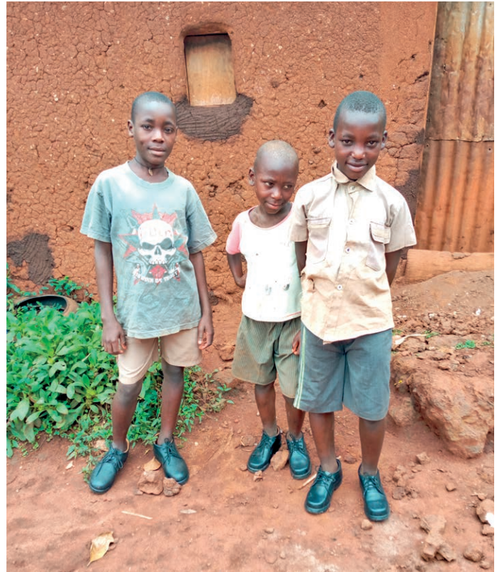
Shoes were given to more than 200 children.