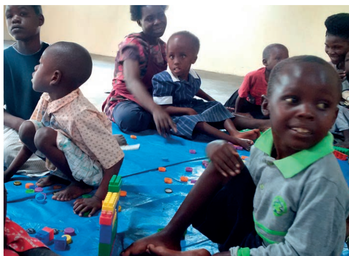
The first children at »Businju schools for all«