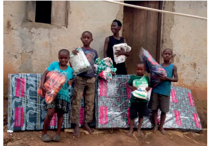
Distribution of beddings to families who had to sleep on the ground

➔ Providing bedding (mosquito nets, blankets, bed sheets) to the most needy cases.