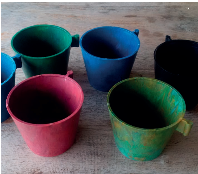
Plastic cups made out of old plastic