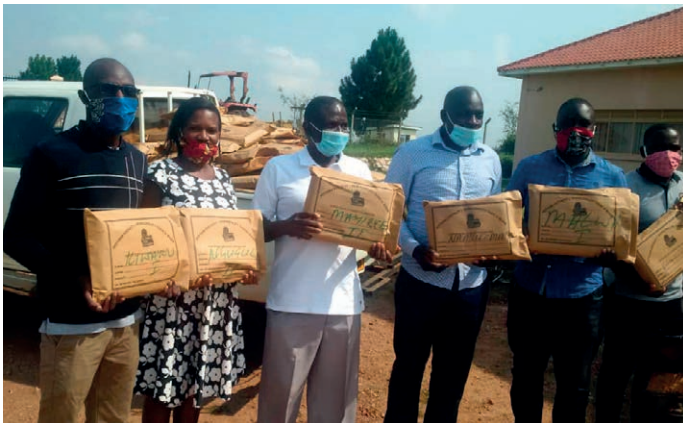
Distribution of learning packages by ACFC in Mityana