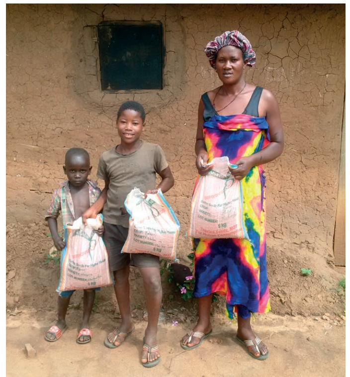
228 families benefited from the seeds programme