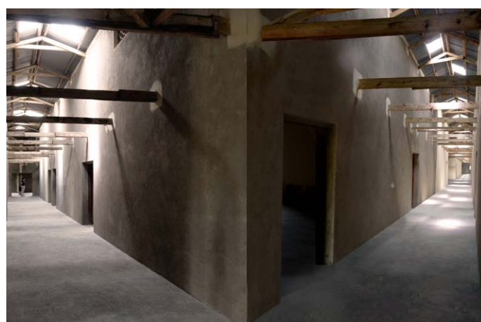
Inside school for all Busunju