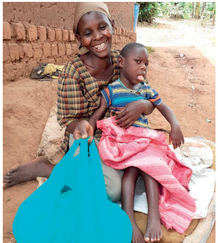
Food distribution als in the special needs departement really helped the mos needy ones.