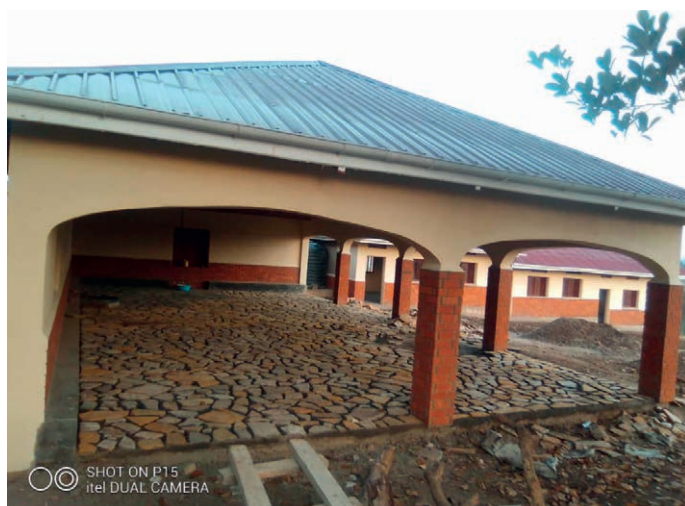
The veranda of the Gruenerbl school in Kamusenene is nearly done