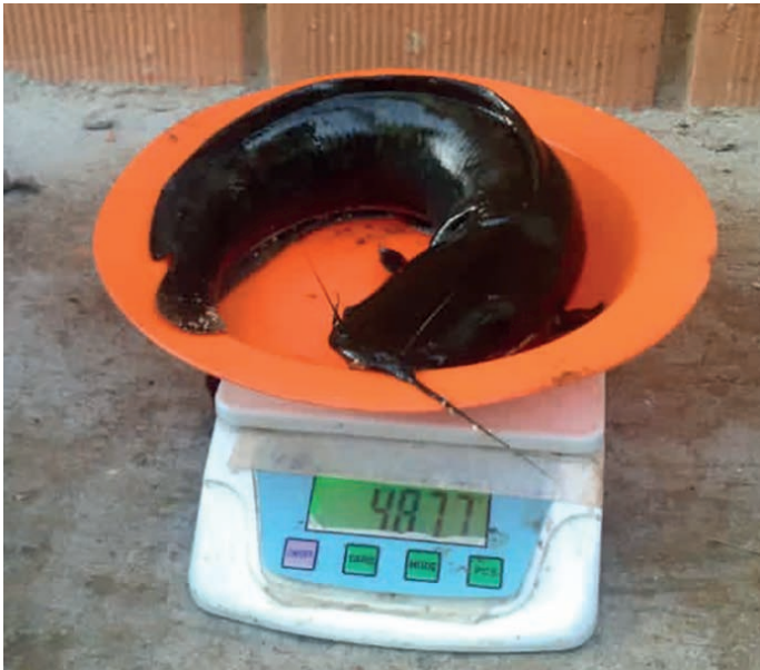
After five months the fingerling became a big fish ready to eat