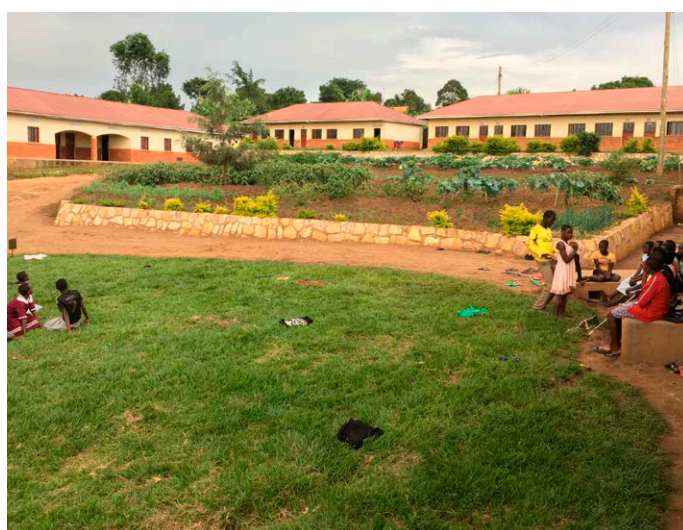
Primary school Kakindu

In the list above nursery and primary schools are only separated where they already have separate administrations. Most of our schools are registered with ministry of Education and Sports and few of them have not yet received their certificates but already submitted documents to the responsible offices. The primary schools in Bongole, Kakindu, Nateete and Lubajja have facilities for boarders. This year however we had to concentrate on homeschooling, so our teachers went to see the children in the villages and met them in small groups to teach them and give them and collect homework. Families of our supported children lack access to internet, television, radio or newspapers.