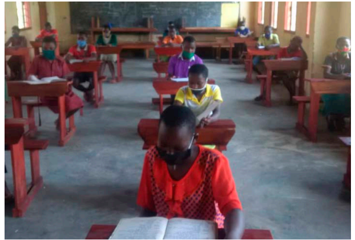
Senior 4 candidates back at school in Bongole