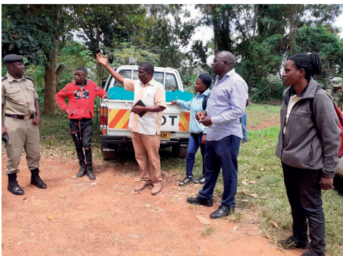
ACFC management team meeting district officials in Mityana to organise food distribution during lockdown