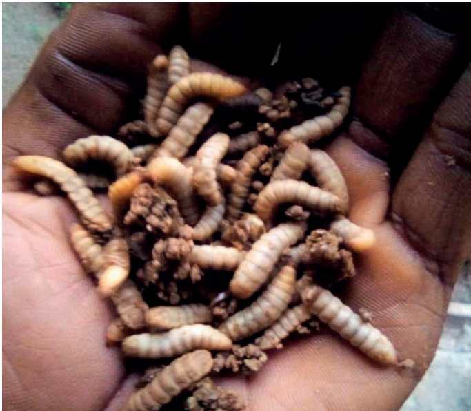
Larvae fed from bio waste serves as chicken and fish feeds