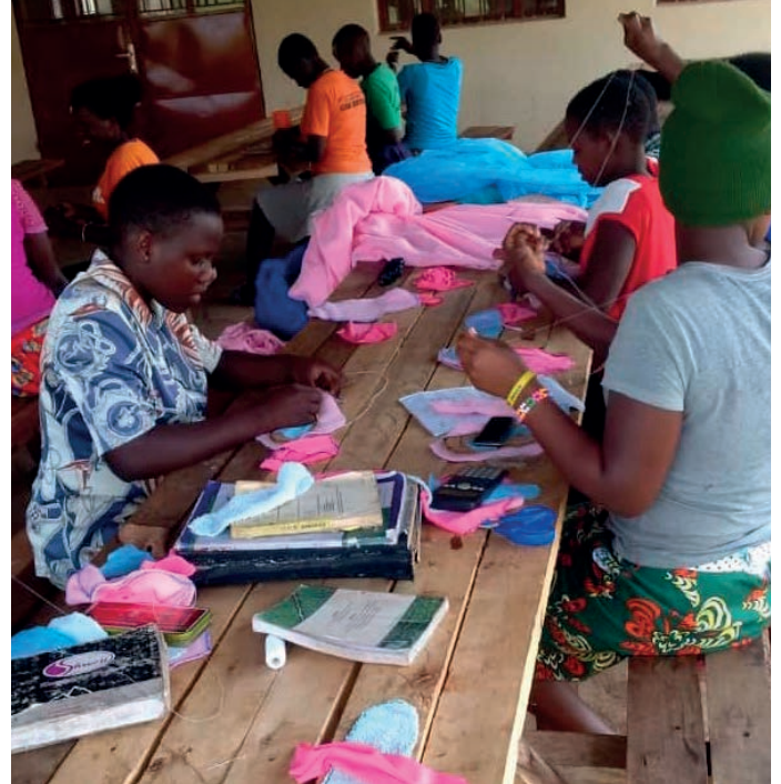
Sanitary pad workshop