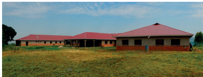
View of »Busunju school for all«