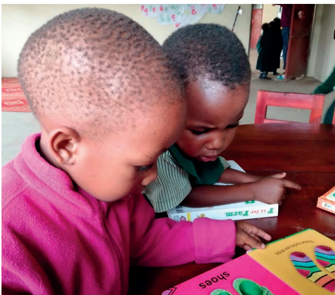
Children at Nakaziba nursery school