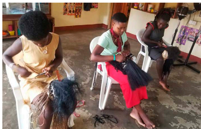
ACFC hairdressing workshop in Zigoti

All these children are provided with school fees, scholastic material, school uniforms and porridge and/or lunch at school. Those in boarding houses are given additional assistance. ACFC tries to involve caretakers as much as possible and urges them to take over responsibility where possible.