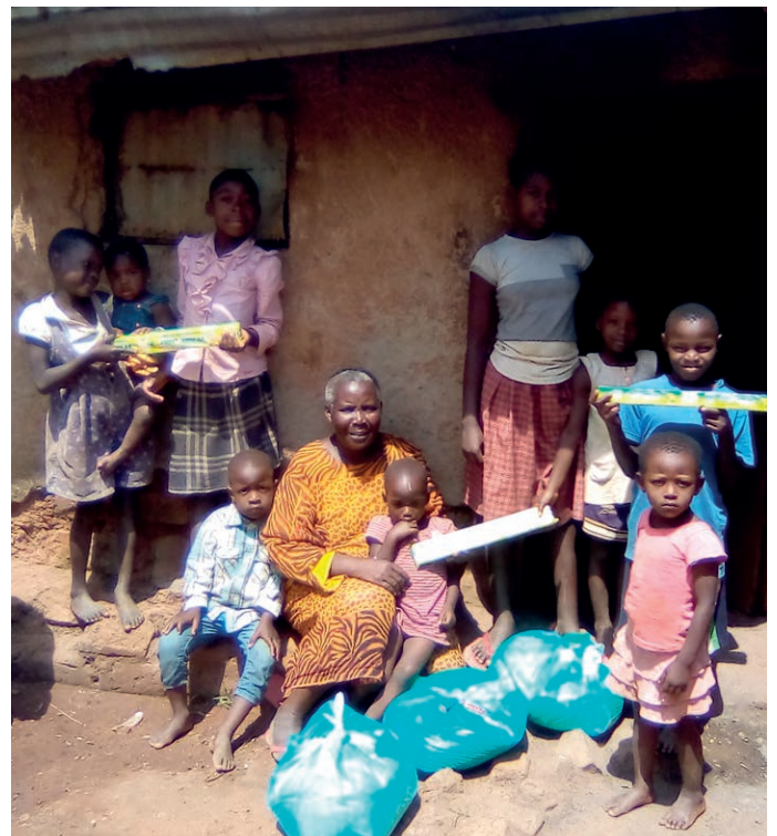
Food distribution to a very needy family