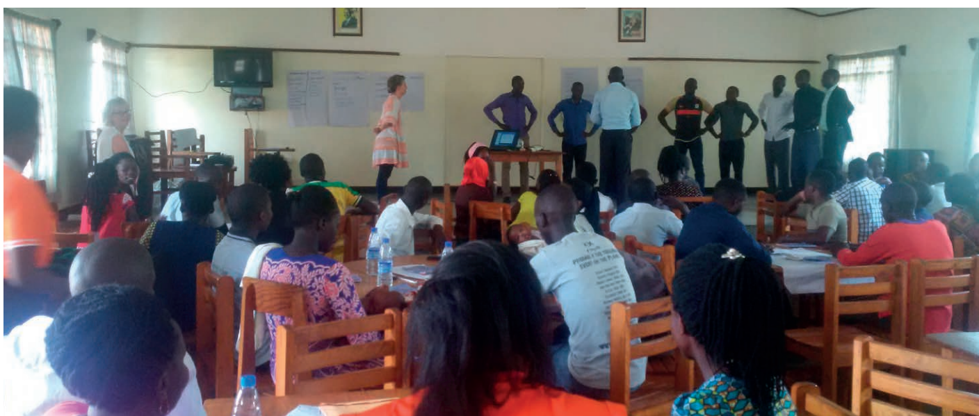
Teachers workshop in January