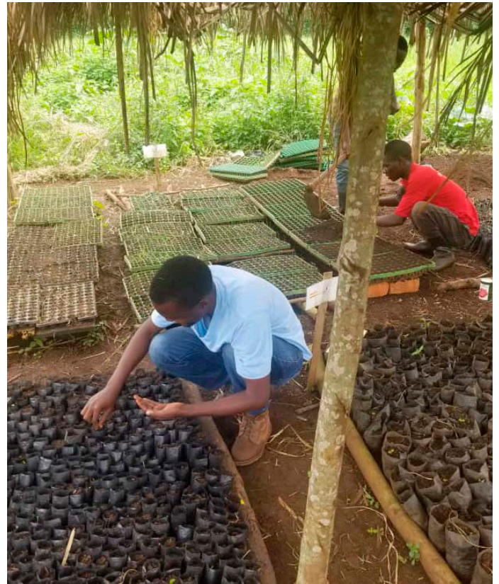
Farming plays a vital role in Uganda's daily life and is taught at all ACFC stations