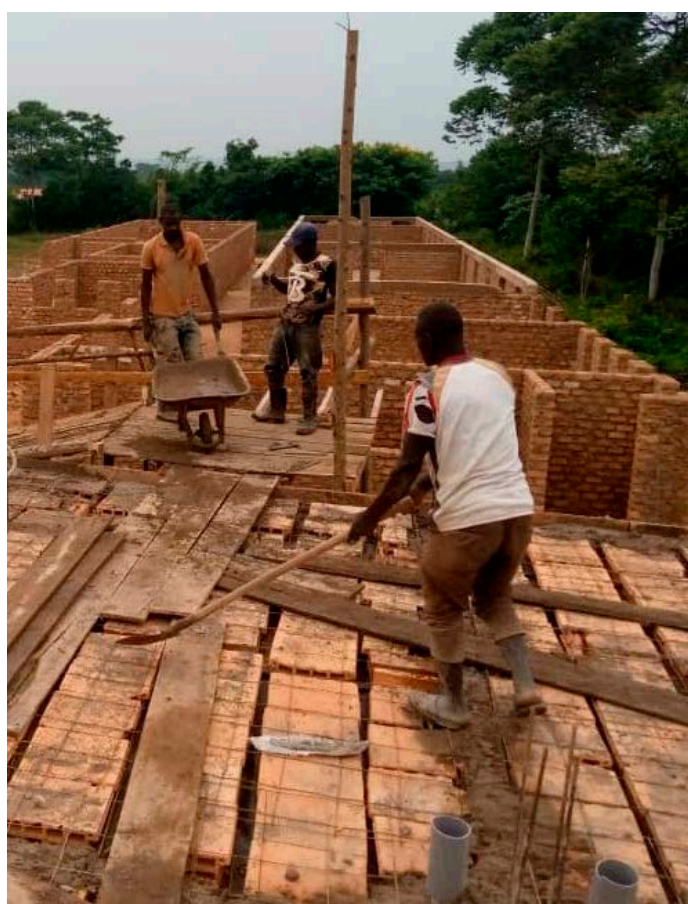
Building site Nkozi