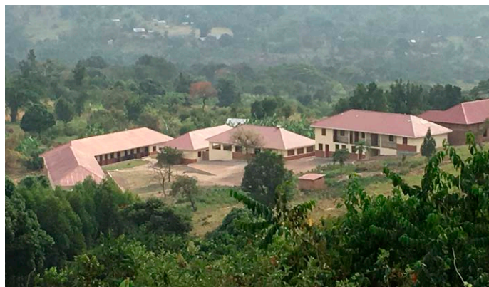
Primary School Kalangalo

ACFC runs several of its own schools. The first were Bongole Primary and Butimba Primary schools which opened in 2010. The last to open was Kamusenene nursery and primary plus nursery section for school for all Busunju.