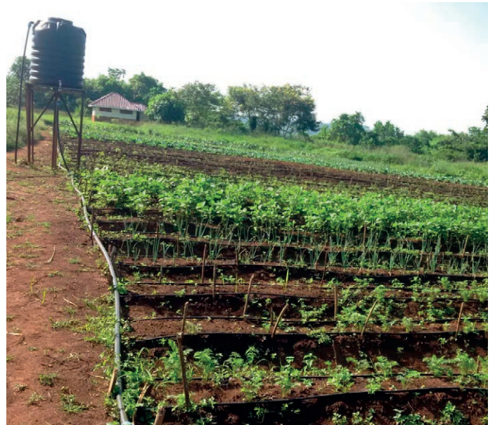
Nakaziba modern farming

The vocational training program started off well in 2020 with courses on solar energy, basics of electricity, plastic recycling, cooking and most of all modern farming.