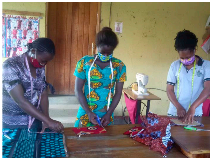
In tailoring masks were made and then distributed to staff and students

All these children are provided with school fees, scholastic material, school uniforms and porridge and/or lunch at school. Those in boarding houses are given additional assistance. ACFC tries to involve caretakers as much as possible and urges them to take over responsibility where possible.