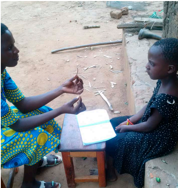
During Lockdown homeschooling was essential for supported children