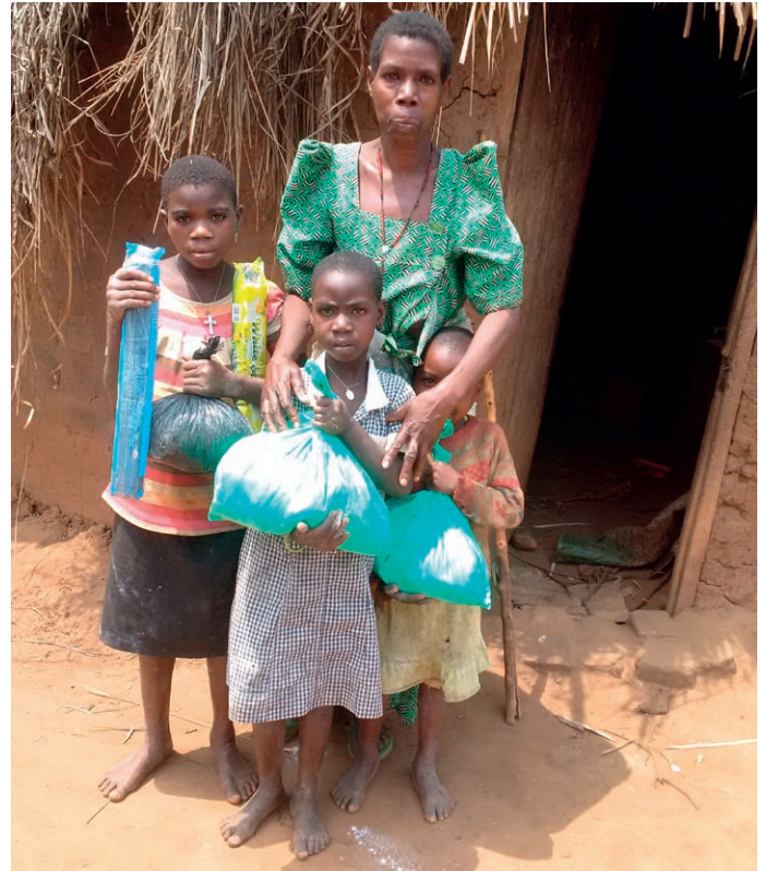
Food support in lockdown