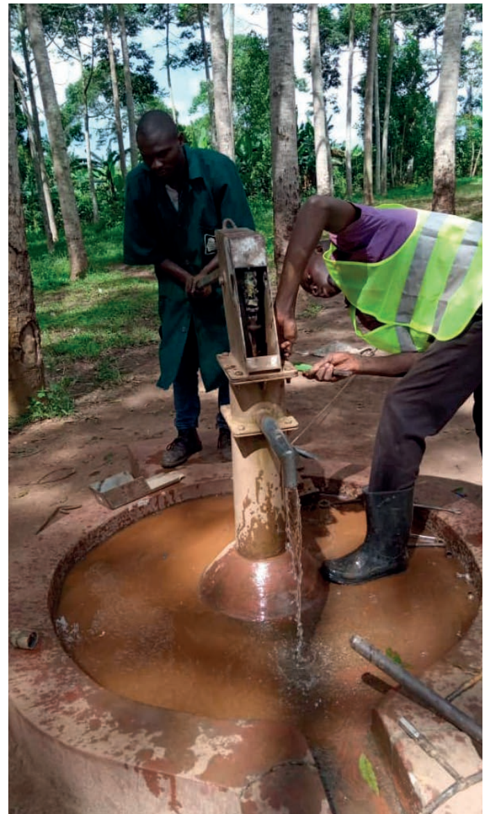
ACFC water team at work

A CHANCE FOR CHILDREN drilled 2 boreholes in 2020. Since the programme started 65 boreholes have been drilled in different sub counties which help communities to get clean water and reduce absenteeism of learners due to carrying water long distances. All boreholes are drilled on community land and each community has to form a water committee which is responsible for care of the boreholes, reporting to our team when there are problems. Due to the lockdown drilling new boreholes was stuck as movements were very restricted. However, the water team of ACFC managed to rehabilitate 163 in 2020 making a total of 245 rehabilitated boreholes in Mityana, Mubende and Kasanda districts.