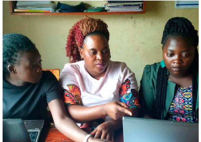
Administration staff of headquarter and CB schools