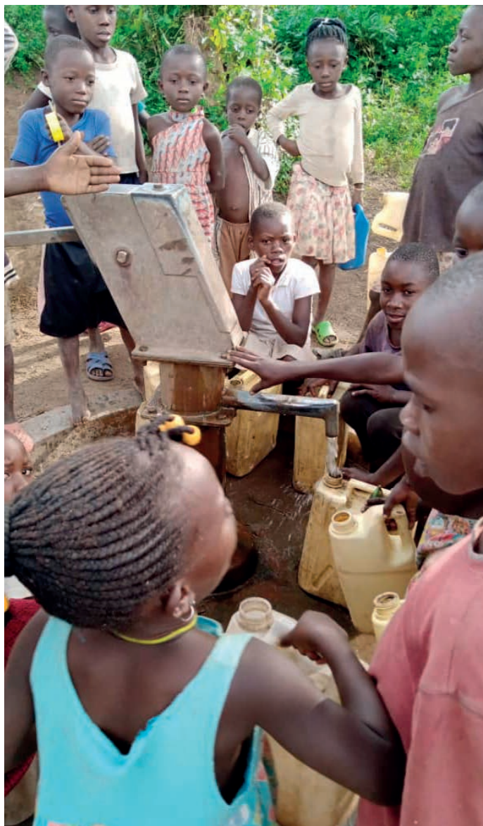
Children benefit a lot from the ACFC water programme