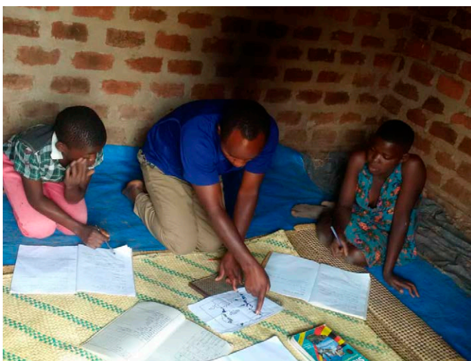
Homeschooling in Nateete