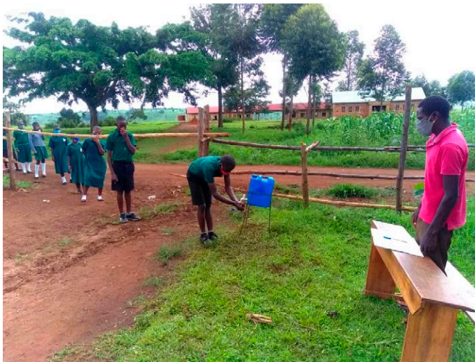
SOPs were strictly followed at ACFC schools