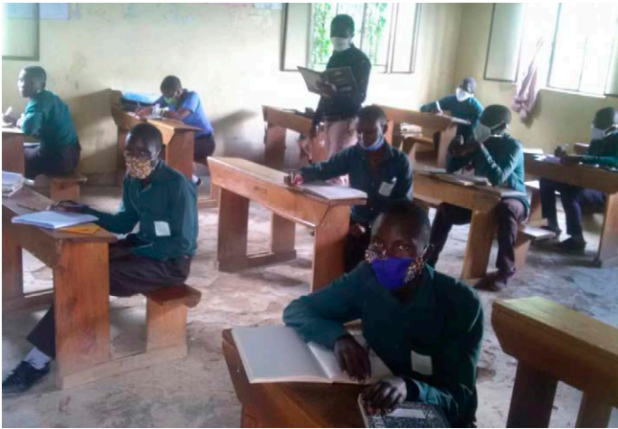
54 candidates back at school

Both Schools have registered Centers for UCE (O level) exams with facilities for boarders. Both schools offer vocational subjects and the best students can do the DIT exams at the end of Senior 3.