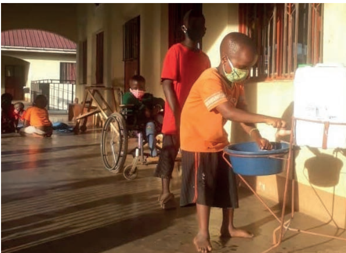
Special needs children back at CB school in Zigoti