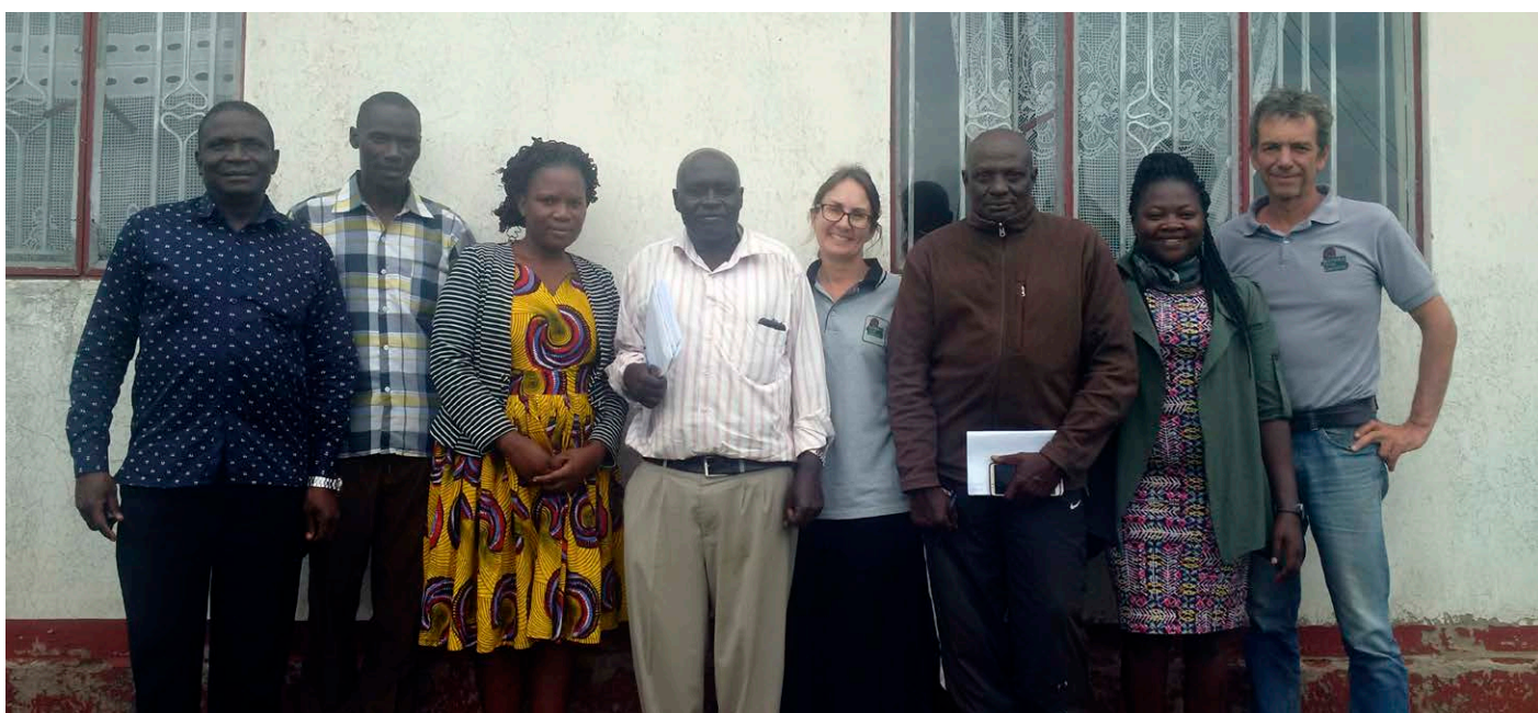
ACFC general assembly 2020