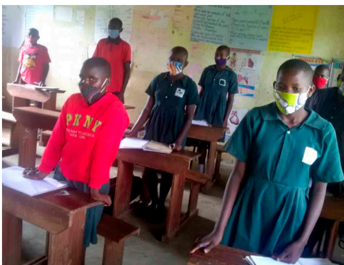
Senior 4 candidates back at school in Nateete