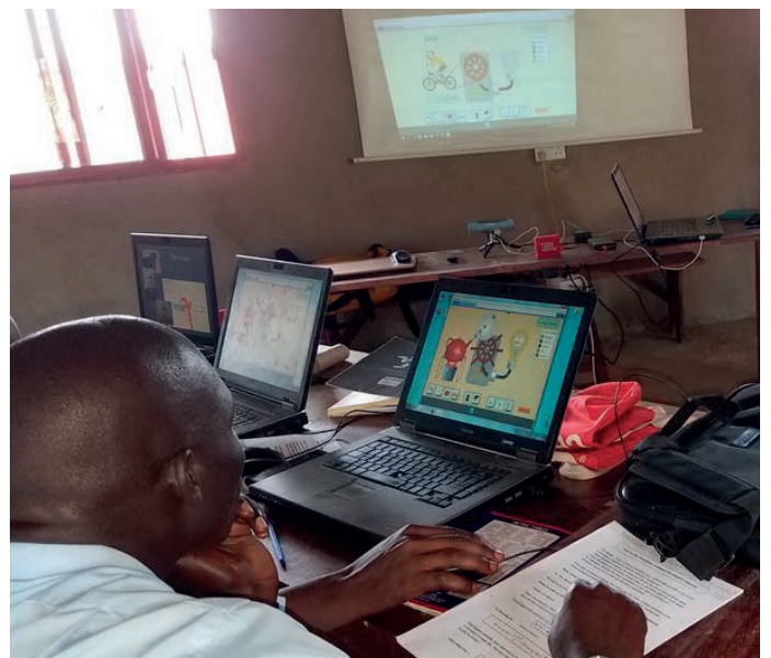
Computer and physics workshop in Nakaziba