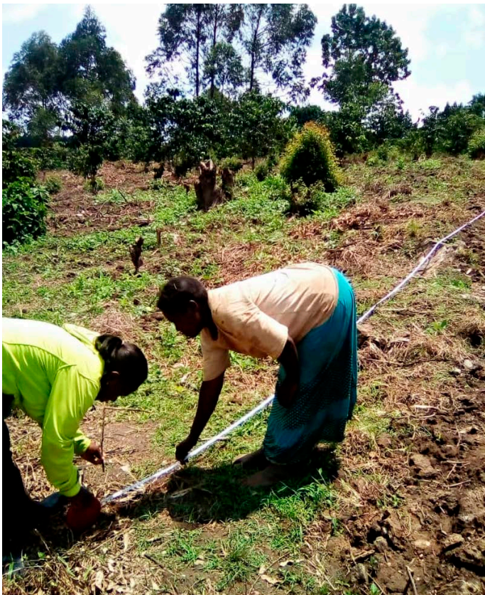
Social worker from Nateete teaching a parent how to measure land for planting